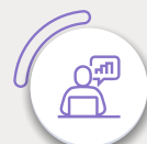
Equity Research Analyst