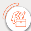
Private Equity Analyst