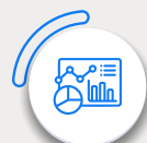
Investment Banking Analyst