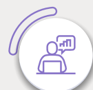
Corporate Finance Analyst

You move beyond financial modeling and begin to understand how real deals, investments, and capital allocation decisions are made.